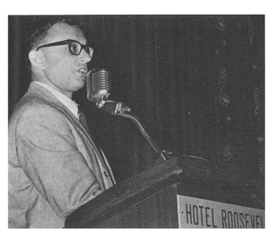
Rep. Allard K. Lowenstein addresses panel