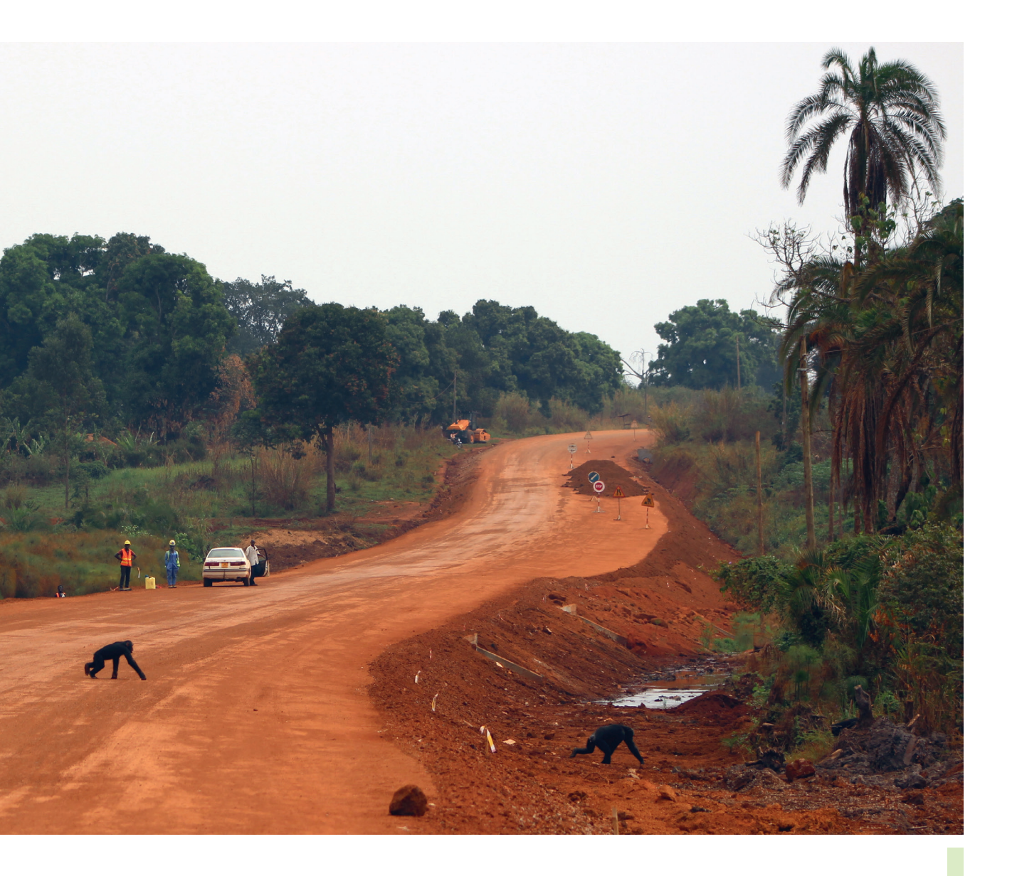
Photo: Historically, wild apes have shared their natural environment with various wildlife species and their associated pathogens, but had limited contact with humans until the current age. Now, many wild apes live in habitats that are subject to different degrees of anthropogenic encroachment. Chimpanzees crossing a road in Bulindi, Uganda.

IPCC, 2023). Ecosystems are struggling to cope with continued and cumulative stresses. All the while, deforestation, encroachment into natural habitat and other human activities are driving an increase in the frequency of interactions between people and various forms of wildlife, including viruses, parasites, bacteria and fungi (Nellemann and Newton, 2002). The consequence is a heightened risk of disease transmission, with serious implications for conservation, biodiversity protection and human health (Balasubramaniam