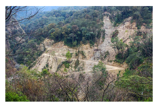
PLATE 2 Dhole habitat destruction caused by hydropower infrastructure construction near Tangting village, Madi Rural Municipality, Nepal (March 2019).

Our camera traps recorded multiple images of domestic dogs, highlighting a risk of disease transmission between dogs and dholes, a threat that has not yet been evaluated. Dholes are known to be susceptible to infectious diseases, particularly rabies and canine distemper viruses (Durbin et al., 2004), which have proven to be serious concerns to the conservation of other threatened canid populations, including Ethiopian wolves Canis simensis (Haydon et al., 2002; Gordon et al., 2015) and African wild dogs Lycaon