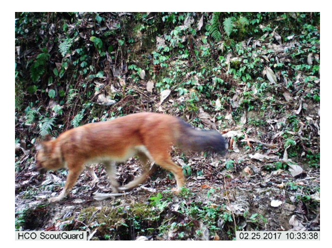
PLATE 1 Camera-trap photo of a dhole Cuon alpinus in Annapurna Conservation Area, Nepal.