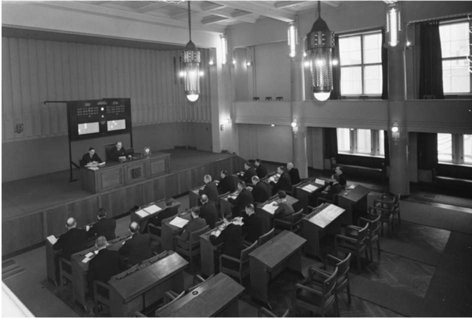
Figure 1. HSE's trading floor in 1937

Note: The chairman sat at the front of the room, typically with two secretaries. Brokers sat behind the benches. The prices were shown behind the chairman as they were inserted into the mechanical trading system. Visitors and interested investors could follow the trading from the second floor.