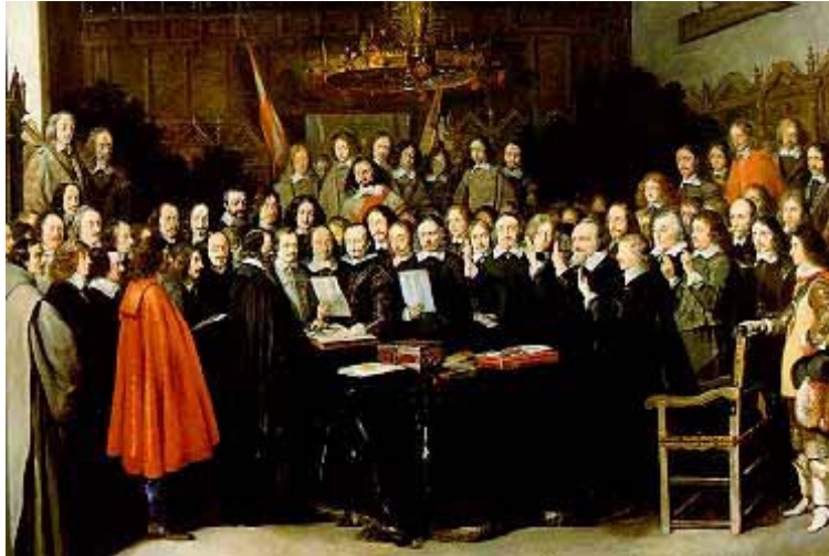
Detail from a painting of the oath-taking of the Peace of Westphalia by Gerard Terborch (1617-1681)