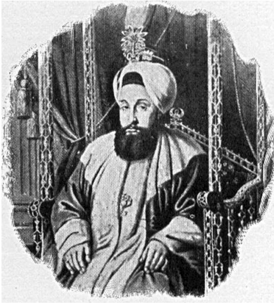
Ottoman Sultan Selim III, ruled 1761-1808.