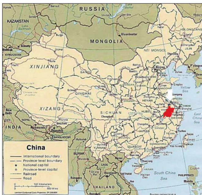
Figure 1: The geographical regions of China.

The 50 \mu l polymerase chain reaction (PCR) amplification system consisted of 500 ng genomic DNA, 0.25 \mu M of each primer and 2 \times PCR Master Mix (Beijing Solarbio Science & Technology Co. Ltd.), containing 20 mM Tris-HCl, 100 mM KCl, 3 mM MgCl 2 , 500 \mu M dNTP, and 0.1 U/ \mu l Taq DNA Polymerase. Polymerase chain reaction amplification reaction conditions were as follows: preheating at 95°C for 10 minutes (min), denaturation at 95°C for 30 seconds (s), annealing at 63–56°C for 45 s (reduced by 0.5°C for each cycle from 63°C to 56°C), extension at 72°C for 45 s, then 20 cycles with the