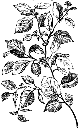
The Witch Hazel Plant.

This drug is highly commended by the British Medical Association's Committee on Therapeutics. Hazeline, being prepared from the fresh green twigs of the plant Witch Hazel, and is much more uniform and reliable in its action than are the tinctures, fluid extracts, etc., prepared from the dried bark.