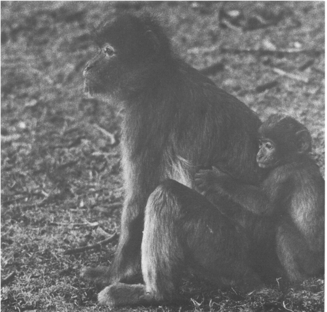
Adult female Barbary macaque with infant, Morocco ( Graham Drucker ). The Barbary macaque