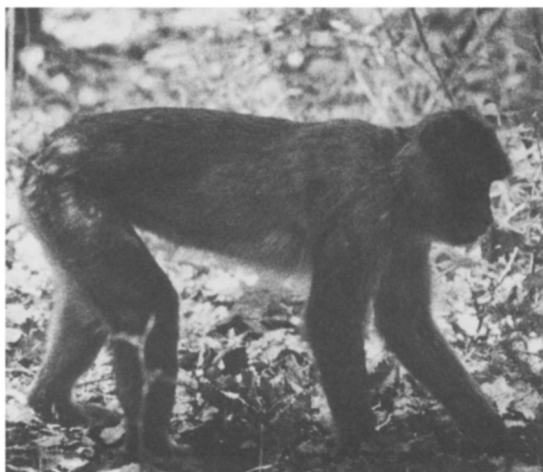
Sub-adult male Barbary macaque, Morocco (Graham Drucker).