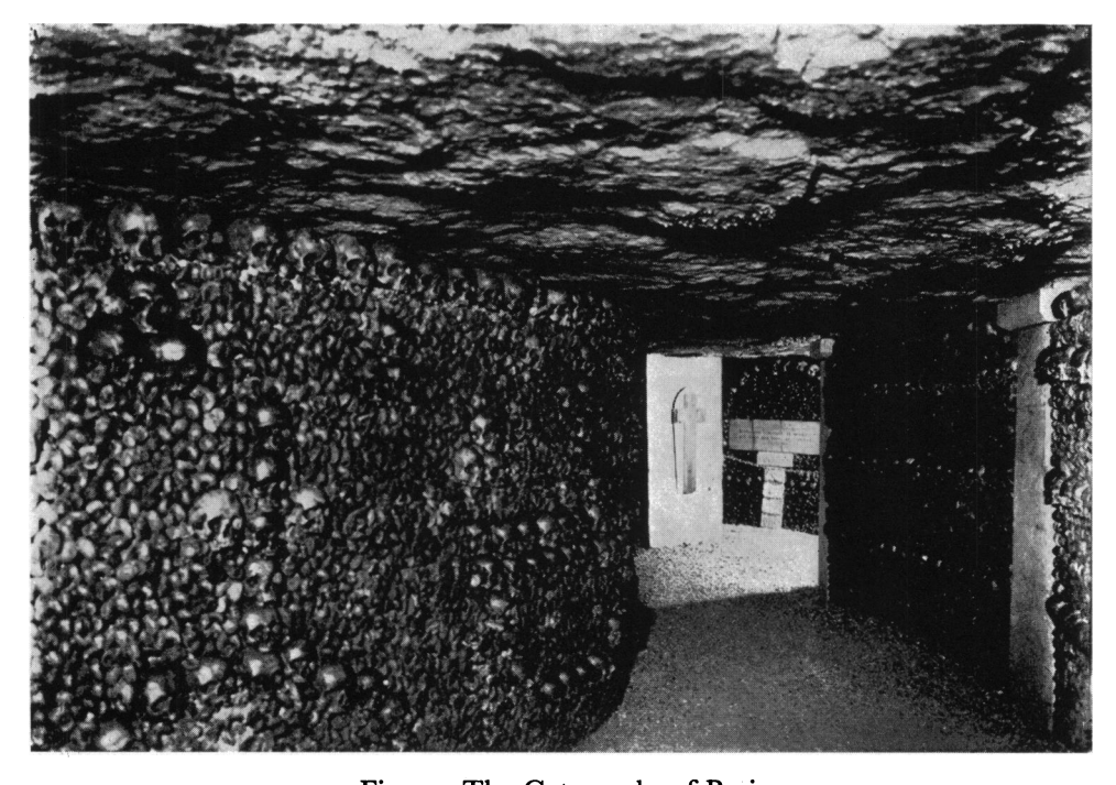
Fig. 1 The Catacombs of Paris (See Møller-Christensen & Jopling: 'An examination of the skulls in the Catacombs of Paris,' pp. 187-188)

(See Matthews: 'Royal Apothecaries of the Tudor Period', pp. 170–180)