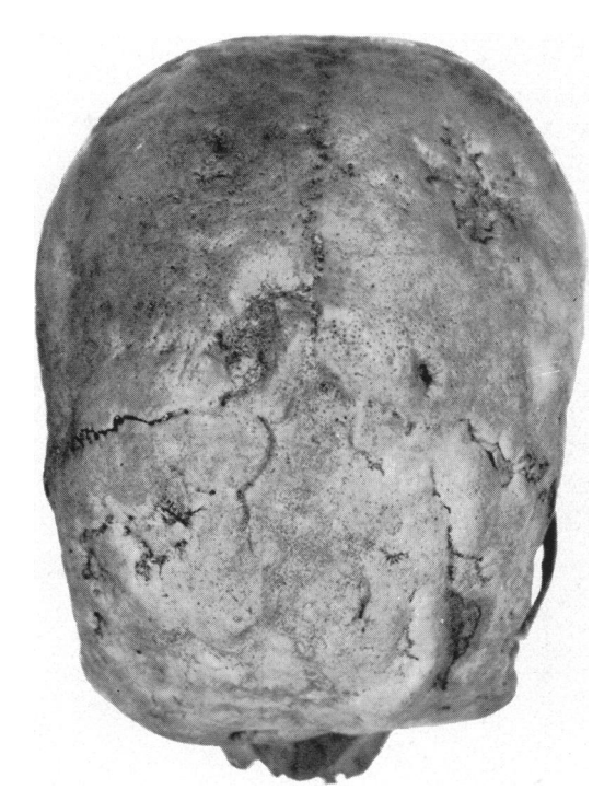
Fig. 4 Syphilis. Skull showing typical changes