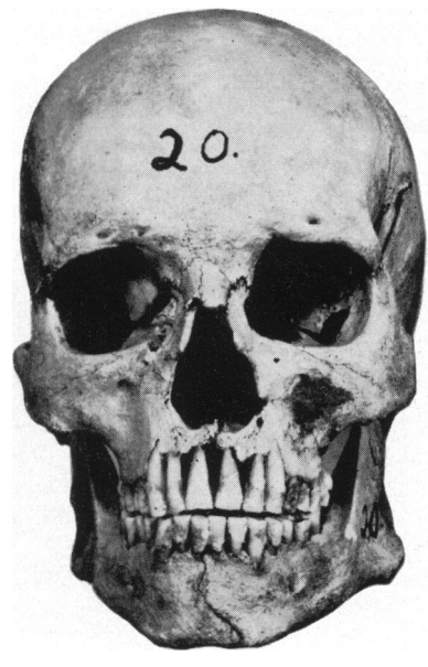
Fig. 3 Leprosy. Skull showing central atrophy of the maxillary alveolar process. Hence loosening or loss of the upper central incisors, in a young person, may be a pointer to the diagnosis of leprosy