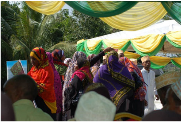
PLATE 1 The celebration for the 18 shehia with registered Community Forest Management Agreements at the close of the Hifadhi ya Misitu ya Asili programme project, attended by the President of the Revolutionary Government of Zanzibar and representatives from the Royal Norwegian Embassy and CARE International (Pemba, August 2015; photo: M. Borgerhoff Mulder).

primarily from high transaction costs associated with the technical complexities of constructing cloud-free satellite images as a forest cover baseline.