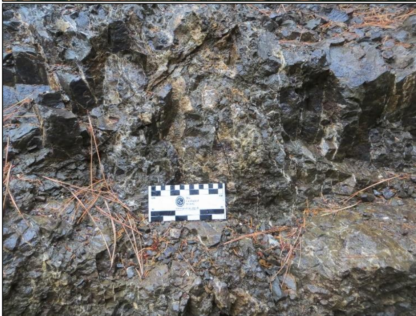
Figure 2: Photo of the west side of the fault in the Cut from the Gold Reserve (GR) mine claim showing the mudstone brecciation and the quartz/carbonate mineralization which is expected to host the in-situ gold.