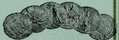
Gold Medal (Highest Award), Allahabad 1910.

Paris 1900, Brussels 1910, Buenos Aires 1910