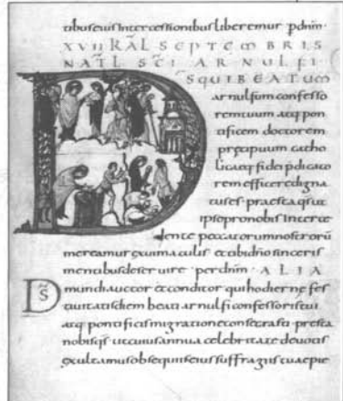
Portrayed on the Heart

An Ahmanson-Murphy Fine Arts Book $60.00 hardcover