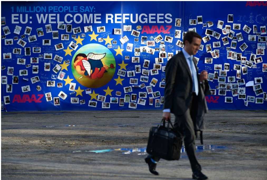
Figure 2. The Wall of Welcome at the Schuman Roundabout square in Brussels, in front of the EU headquarters, 14 September 2015.