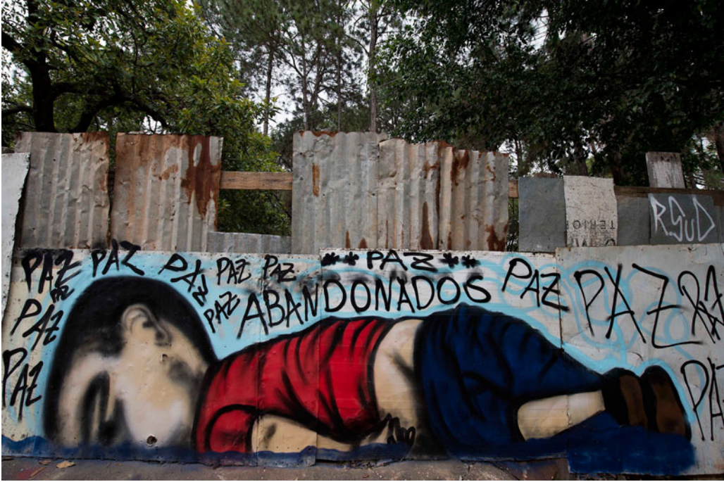
Figure 1. A mural in Sorocaba, ninety kilometres from Sao Paulo, Brazil, 6 September 2015.

of context, in the form of an angel or sleeping in a child's bedroom. 71 It is worth noting though that those less overtly political mediations were in some cases applied to make explicitly critical-political statements. For example, the global civic society organisation Avaaz used the frequently circulated motif of Alan Kurdi as an angel in a Wall of Welcome located right in front of the European Union headquarters in Brussels (Figure 2). Thus while these remediations of 'Kurdi' can be separated into different analytical categories, for example those that decontextualise or recontextualise the figure of Alan Kurdi when the photographs were circulated, seen and (re)used we see a process of emotional bundling as mediations are connected across those analytical categories. 72