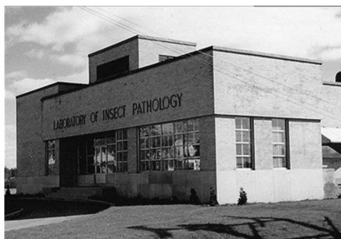
Fig. 1. The Laboratory of Insect Pathology in Sault Ste. Marie in the early 1950s. The Laboratory was renamed the Insect Pathology Research Institute in 1959. This institute was merged with the Chemical Control Research Institute in 1977 to form the Forest Pest Management Institute, which merged with the Ontario Regional Forestry Centre in 1997 to form the current Great Lakes Forestry Centre.

time the Laboratory of Insect Pathology had been completed (1950, Fig. 1), the price tag approached CDN$750 000, the equivalent of roughly CDN $7.0 million today.