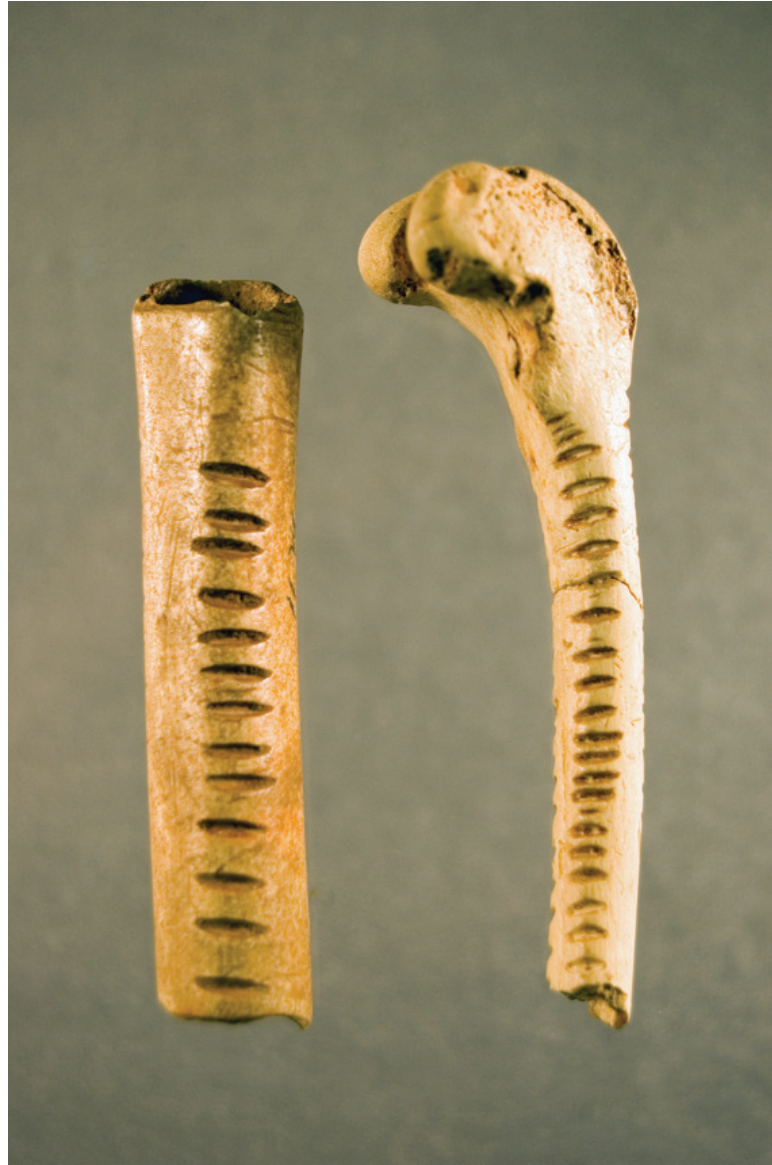
The Abri Cellier artefact (c. 28,000 bp); the notches might have represented quantity notations (see p. 26). (Courtesy of Logan Museum of Anthropology, Beloit College (LMA 100180 and 100181).)