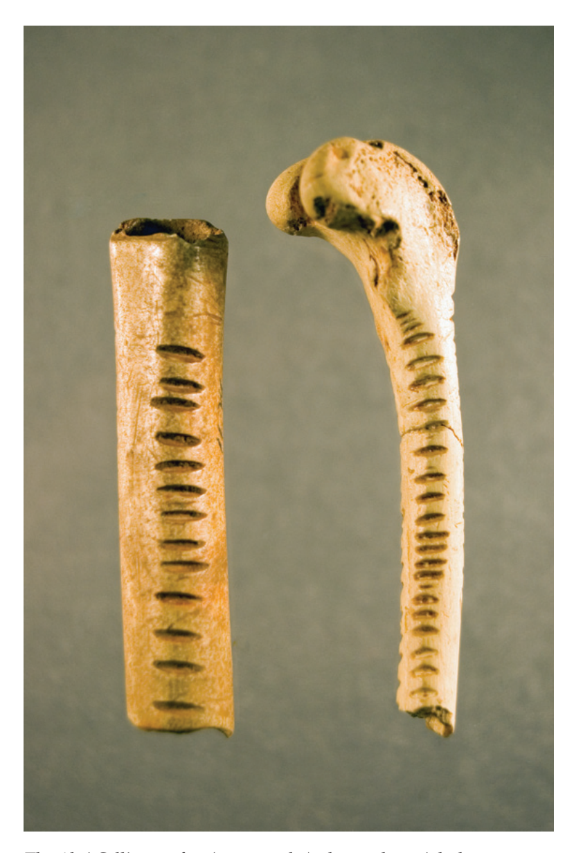
The Abri Cellier artefact (c. 28,000 bp); the notches might have represented quantity notations (see p. 26). (Courtesy of Logan Museum of Anthropology, Beloit College (LMA 100180 and 100181).)