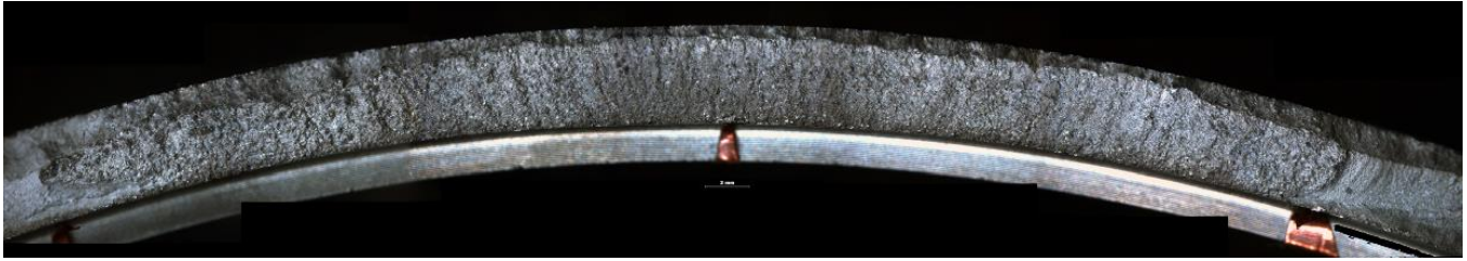
Figure 1. Initial Fracture Zone in Circumferential EB Weld Showing OD Shear Lip, Tear Ridges, and Mid Span Demarcation Line (3x magnification)