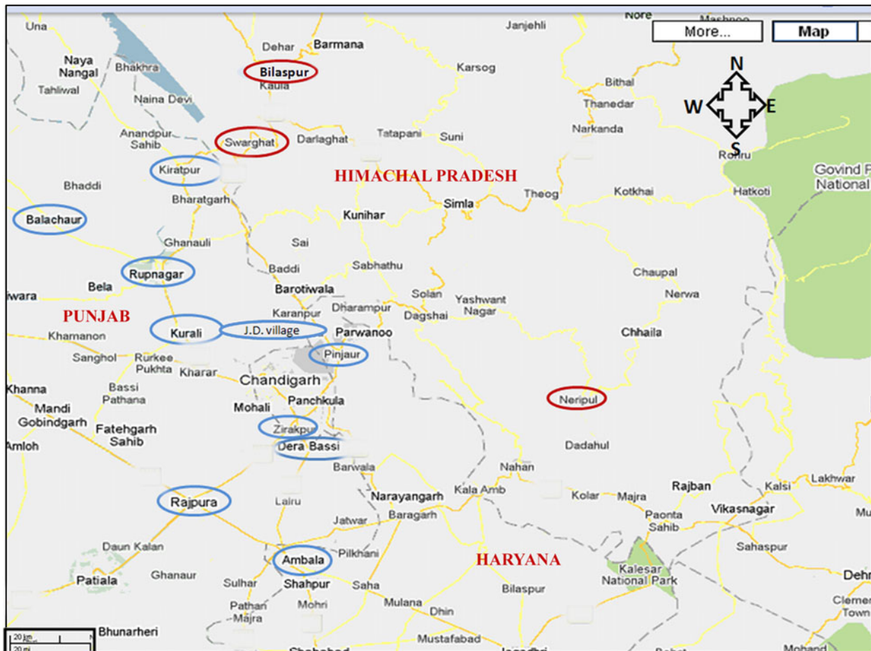
Fig. 1 [colour online]. Sample collection sites: samples were collected from Bilaspur, Swarghat, Kiratpur, Ropar, Kurali, Jayanti Devi, Pinjore, Zirakpur, Derabassi, Naripul, Balachaur, Ambala, Rajpura. Areas circled in red represent hilly areas and areas circled in blue represent plain areas. (The figure has been adapted and modified from https://www.google.com/maps/preview/place/Chandigarh .)