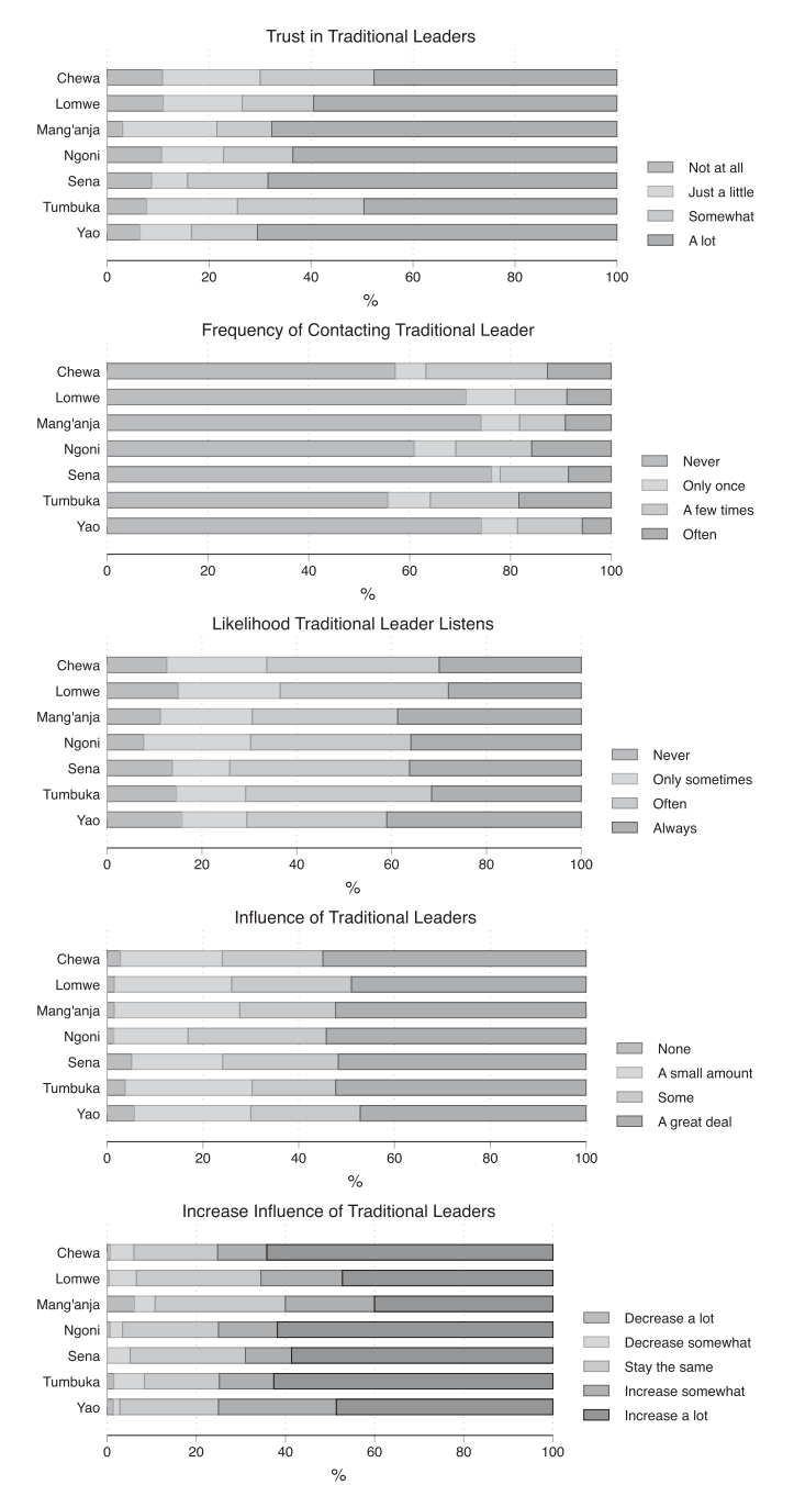
Figure 1. Attitudes towards traditional leaders by ethnic group in 2008, prior to the Lhomwe cultural revival. Note : Data come from Afrobarometer round 4, 2008. n = 1,128-1,158.