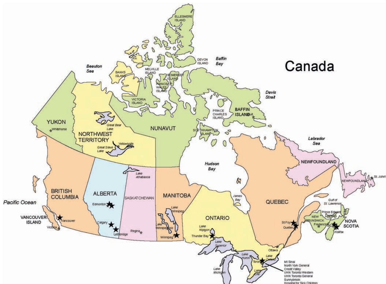
Figure 1. Map of methicillin-resistant Staphylococcus aureus study site locations.

They attempted to contact patients whose wound swabs grew MRSA to undertake a structured standardized telephone interview (Appendix 3). Both data collection tools were intended to collect basic demographic information and select information regarding previously identified MRSA risk factors. 12–20 Patients with laboratory-confirmed MRSA were contacted approximately 2 weeks following their ED visit. Trained interviewers made three attempts to reach each patient on different days and at different times, including evenings and weekends. Data were collected on demographics, clinical presentation, defined CA- and HA-MRSA risk factors, treatment, and outcomes. Patients were also asked about advice received regarding transmission prevention strategies. Interviewers were blinded to the patients' MRSA strain type.