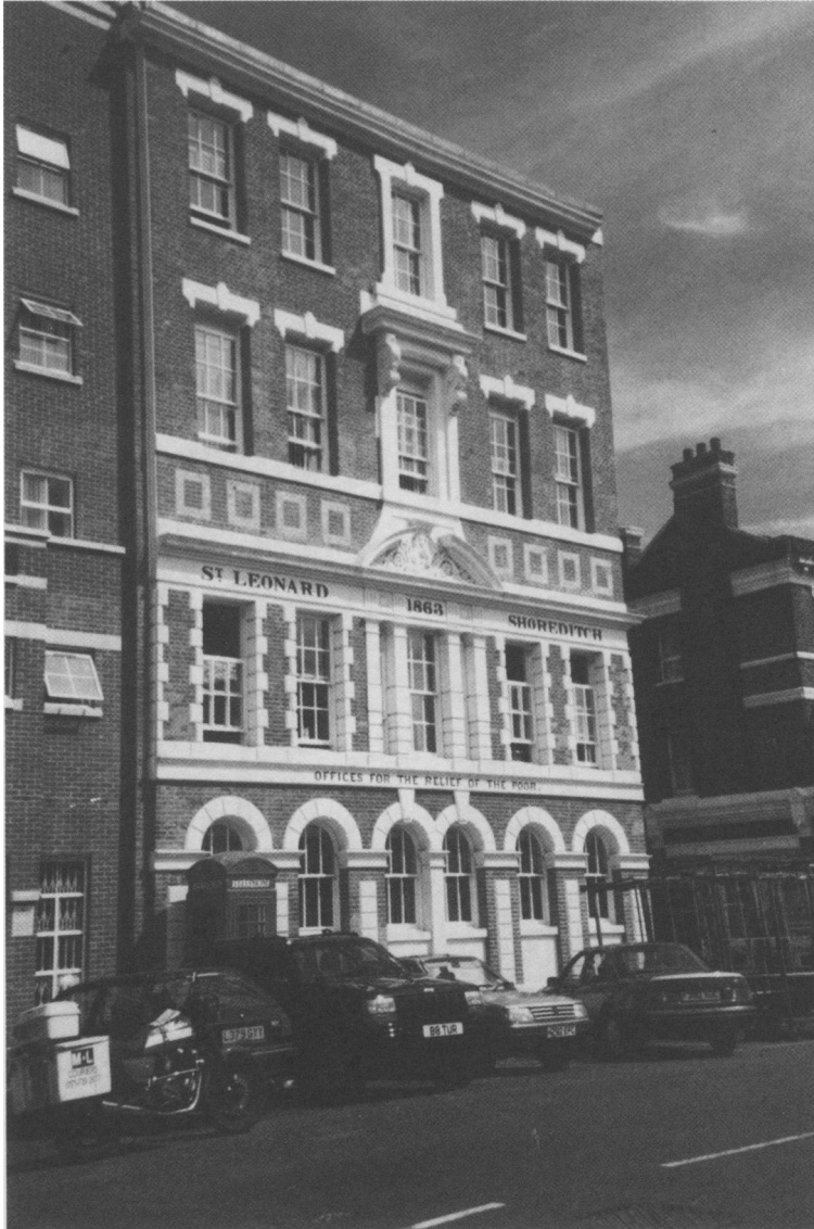
Figure 3: St Leonard's, Shoreditch, Offices for the Relief of the Poor, 1863.

The question of the condition of the insane in workhouses is one to which we have recently called earnest attention. Whether a few old and harmless imbecile patients may not properly be left in the workhouses is not a matter of very great moment; but that it is entirely unjustifiable to keep in the workhouse for one hour longer than is absolutely necessary an