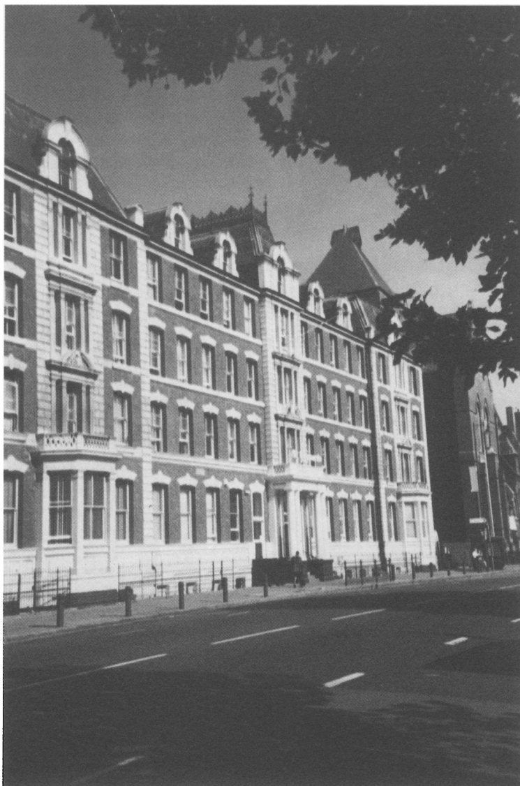
Figure 4: Shoreditch Workhouse Infirmary, 1865.

acute case of insanity, anyone who knows what are the requirements of treatment in such cases, and what workhouses at present are, must feel most strongly. 88