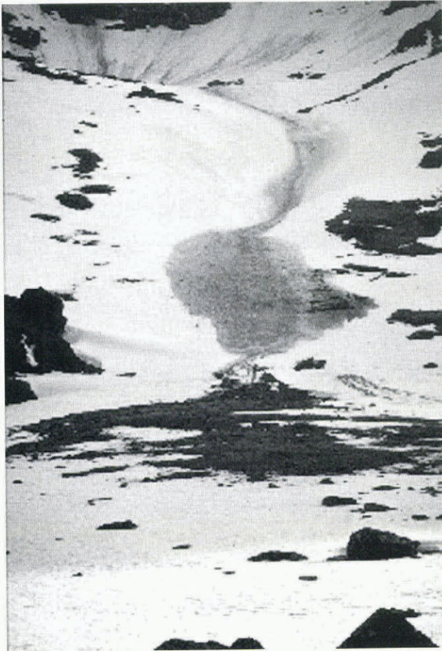
Fig. 1. Slush torrent of 3 June 1995 released in the Kärkerieppe cirque, Kärkevagge, northern Sweden.

zone of the slush torrent observed on 3 June 1995, is situated in a small cirque (Kärkerieppe) at almost 1000 m a.s.l. The Kärkevagge area has been well-investigated (e.g. Rapp, 1960, 1995; Nyberg, 1985, 1989; Schlyter and others, 1993); the Kärkerieppe study site and instrument set-up of the field campaign in the spring of 1995 has been documented by Gude and Scherer (1995).