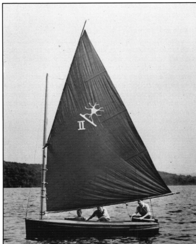
Figure 1 — Dr. Penfield's sailing dinghy "Astrocyte II".

During the next year, I commuted almost every week from Providence to Montreal, driving at night in all kinds of weather in order to fulfill my teaching, research, and clinical obligations in Providence while beginning collaboration with Dr. Penfield and colleagues in Montreal. Fortunately, in one of the two trial patients I brought to Montreal we did find a clear focal lesion