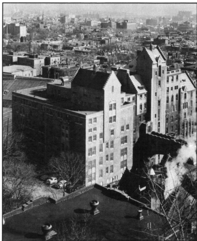
Figure 4 — The MNI with the addition of the McConnell Pavilion opened in 1953.