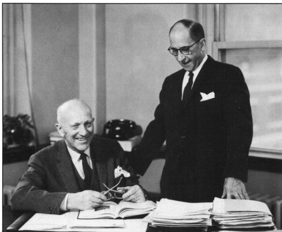
Figure 5 — Dr. Penfield and Dr. Jasper upon completion of their book, "Epilepsy and the Functional Anatomy of the Human Brain" published in 1954.

It was also in 1953 that Dr. Penfield and I completed a summary of our clinical and electroencephalographic studies of hundreds of epileptic patients with results of electrical stimulation and recording from the exposed cortex during neurosurgi-