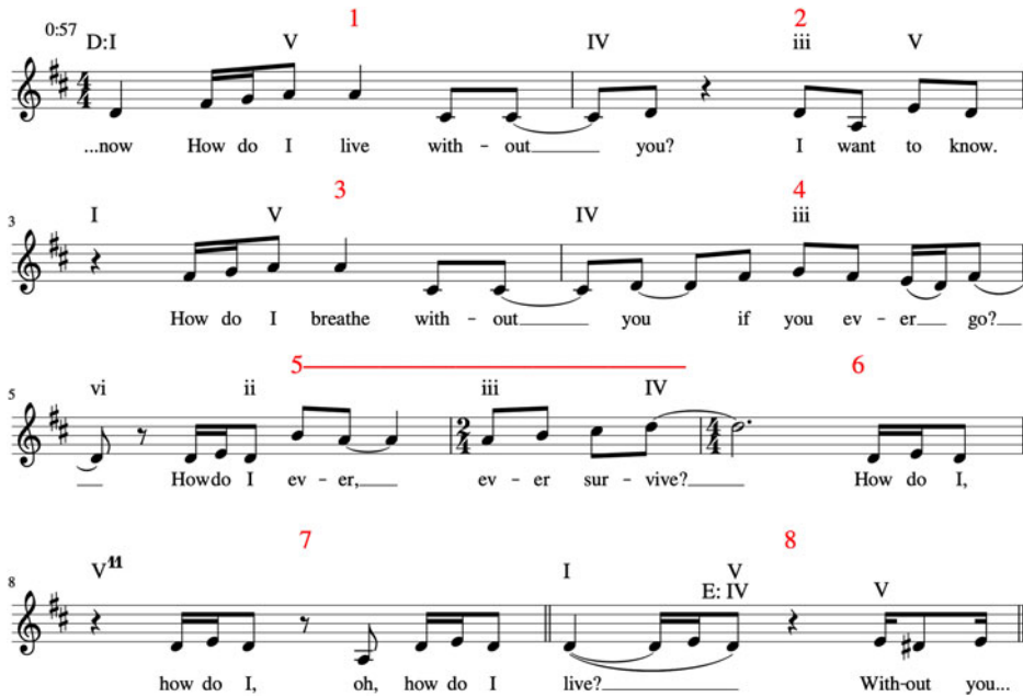
Example 11: The first chorus of Leann Rimes's 'How Do I Live' (1997). Red numbers interpret the expansion of the eight-measure basic phrase.