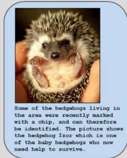
Some of the hedgehogs living in the area were recently marked with a chip, and can therefore be identified. The picture shows the hedgehog Izor which is one of the baby hedgehogs who now need help to survive.

Please support the project "Save the hedgehogs"