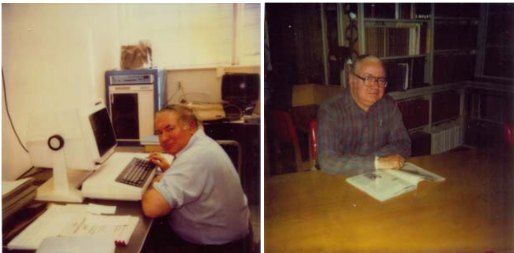
Figure 2. Collecting data in the USNO Library for inclusion in the WDS.