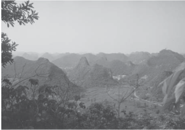
Plate 1 Typical landscape of the area surveyed for François' langur in Fusui Nature Reserve (Fig. 1), with steep, forested limestone hills, villages and cultivated land.

and are separated from each other by farmland, rivers and roads (Plate 1). The maximum height of the hills surveyed was 600 m. Steep cliffs make most of the hill-sides inaccessible, and so it was necessary to undertake surveys from the base of the hills. It was also possible to use trails to reach central valleys within groups of hills. The vegetation in the Reserve is tropical forest typical of the Sino-Vietnamese plant province and is dominated by Eberhardtia aurata , Hopea chinensis and Saraca chinensis (Wang et al. , 1989), although the species composition varies depending on the degree of human impact. Semi-deciduous natural forest now occurs in <10% of Guangxi (WWF, 1996) and is found only on the hills, where trees are mostly small in size and covered with lianas. Almost all the flat ground both inside and outside the valleys has been cultivated. The natural habitat has become fragmented and the langurs occur in isolated populations with no connecting corridors of suitable habitat.