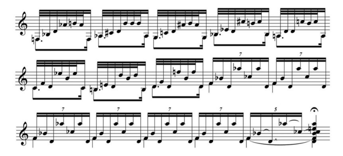
Figure 3. Excerpt Cadenza Concerto para Violão e Orquestra. Transcription by the author.

Villa-Lobos incorporates several intertextual references to his own compositions within the concerto, including pieces for the guitar such as Study No. 4 and Prelude No. 4. Although these quotations