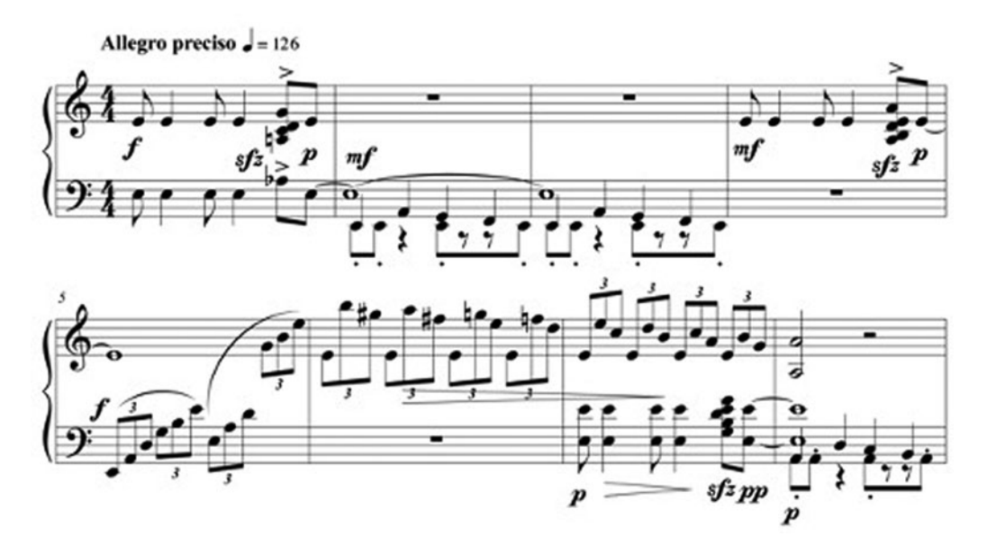
Figure 2. Excerpt First Movement Concerto para Violão e Orquestra (Piano Reduction). Transcription by the author.

measure 1 of the piano reduction (played by the trombone in the orchestra) is an example of what Coelho de Souza calls an odd note. The entrance of the guitar, which is organized around a collection made up of the instrument's open strings (E-A-D-G-B-E), further strengthens the quartal harmony of the section.