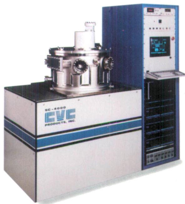
CVC SC-4000 deposition system with load lock

CVC can put superconductivity to work for you. We can deposit the High Tc superconducting thin films you need. Or build a system for you and show you how to make them yourself. We guarantee our films to be superconducting above 77 K. Order a YBCO film on zirconia and see the performance for yourself. We can also deposit other compositions and buffer layers on various substrates. To make your own thin films, order the CVC SC-4000 superconductor system. The versatile SC-4000 can be equipped with: high temperature heat for insitu anneal; substrate rotation, rf bias, rf and dc sputtering sources; evaporation sources, ion gun, laser, auto process control and load lock. Call us today to discuss your superconducting thin film requirements— (800) 448-5900 , in NY (800) 962-5252 .