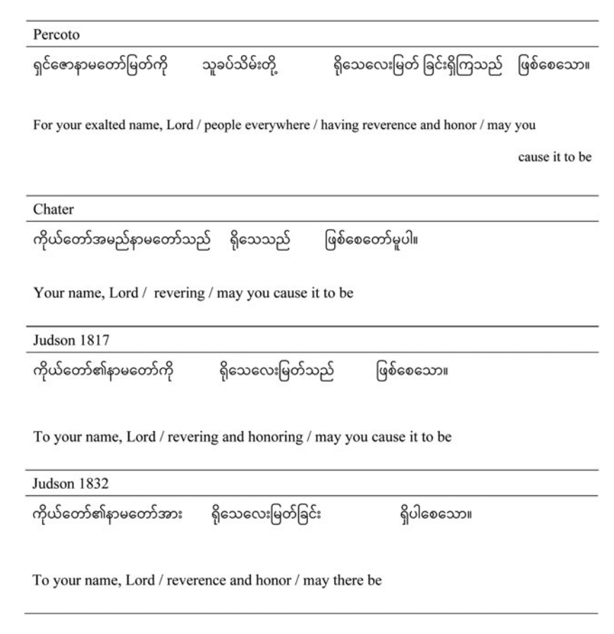
Figure 4. The First Petition of the Lord's Prayer (Percoto 1776; Chater 1812; Judson 1817&1832)

hallowed/sanctified," into a noun phrase, something achieved very easily in Burmese by adding the particle stitute to the verb. Percoto now has a noun phrase, "reverence and honor." This requires him to add the verb stifute ("to have"), leading to his next translation decision, which is to identify who will have respect and honor. So Percoto adds spossible ("people everywhere"), a phrase nowhere to be found in the Greek source text. In this sense, there is an element of paraphrase or commentary in Percoto's translation, but it is accurate commentary. The first petition of the Lord's prayer, "Hallowed be your name," is a prayer for God to vindicate himself on earth by fulfilling his promises to his people through establishing his kingdom on earth (the second petition). In the context of first-century Judaism when Jesus prayed this prayer, and subsequently in Christian faith, when the kingdom of God is established, all people will acknowledge God as the true God. Percoto expresses this in his paraphrastic translation.