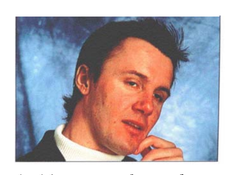
...a reliably retained prosthesis