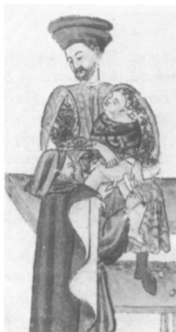
From Jewish Life in Renaissance Italy