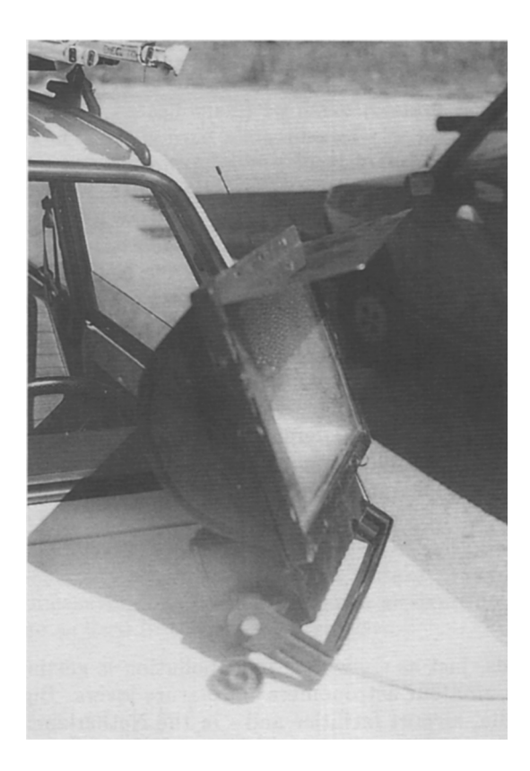
Figure 4. Modification of a symmetric beam with a simple metal screen. No more light in the sky! Cost: US$2 each.

MARECO) or the new lanterns cut-off (made by NERI) or modified by the technical office;