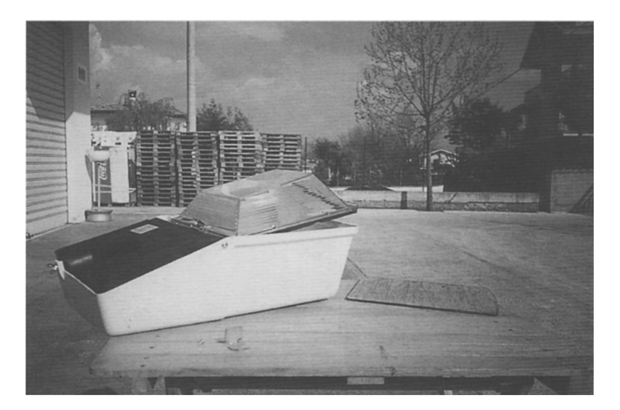
Figure 1. Modification of street lighting fixtures with a flat tempered glass to give more transmission of light onto the road, with drastic reduction of glare and light-pollution. Cost: US$5 each.