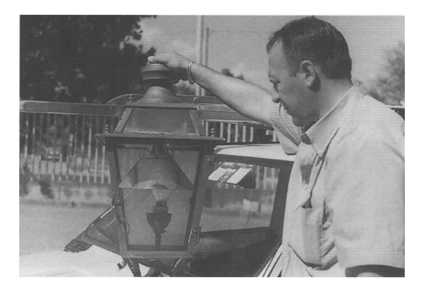
Figure 2. Modification of an open latern "old style" with a cheap and functional conical metal screen. Dispersion flux is reduced by 50%. Cost: US$5 each.