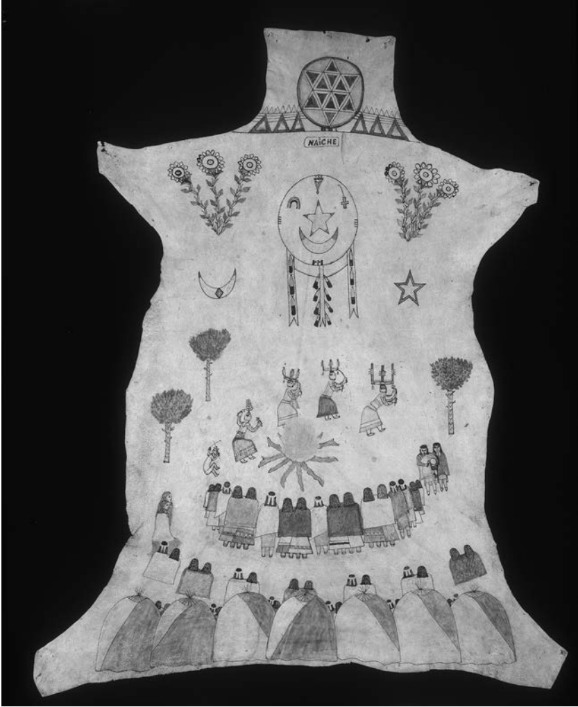
FIGURE 1.1 An Ndé painted deerskin by Naiche, ca. 1909.