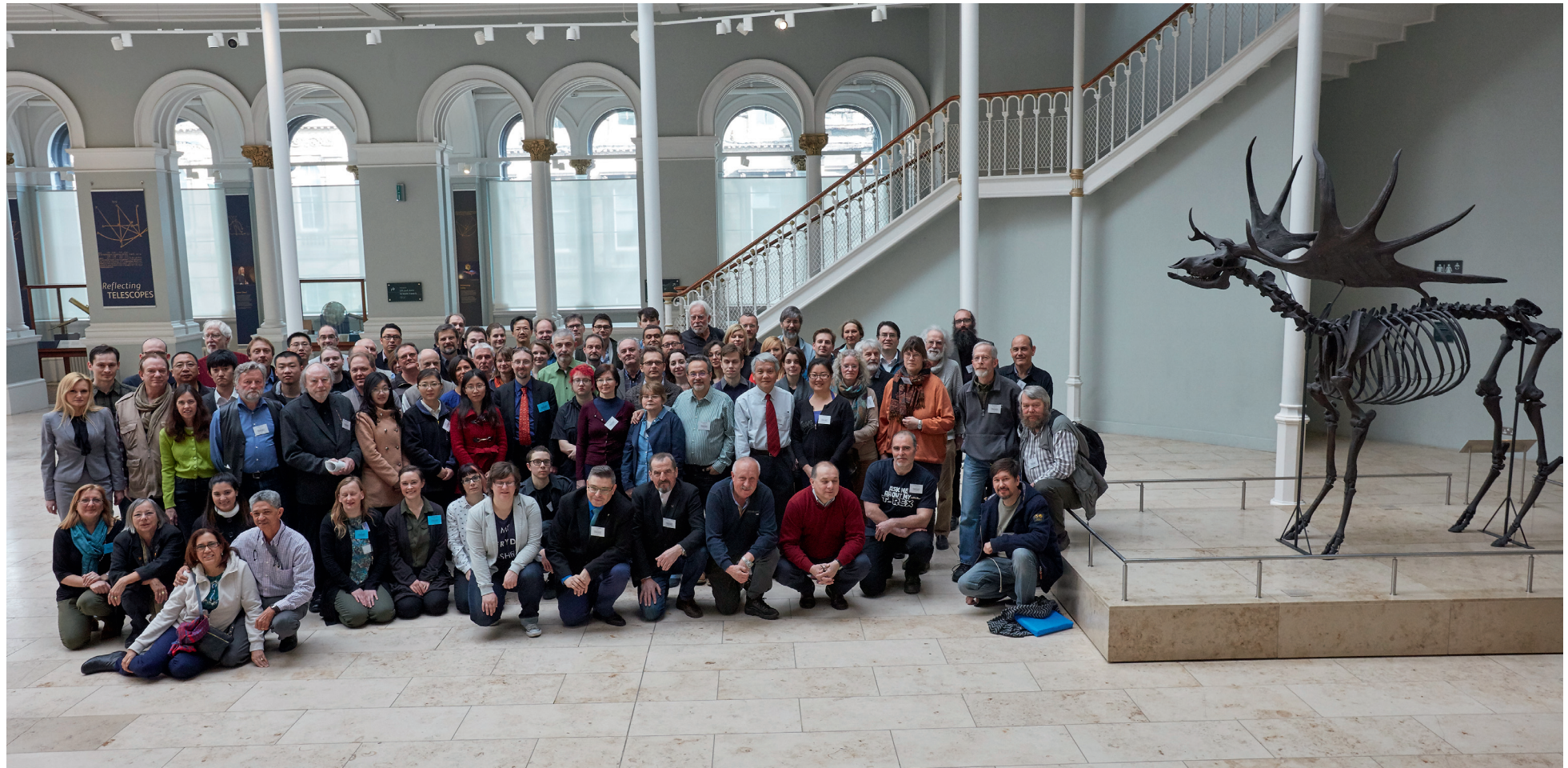
The conference delegates in the Grand Gallery of the National Museum of Scotland, next to the first complete skeleton of Megaloceros giganteus (12,300 years old, from the Isle of Man).