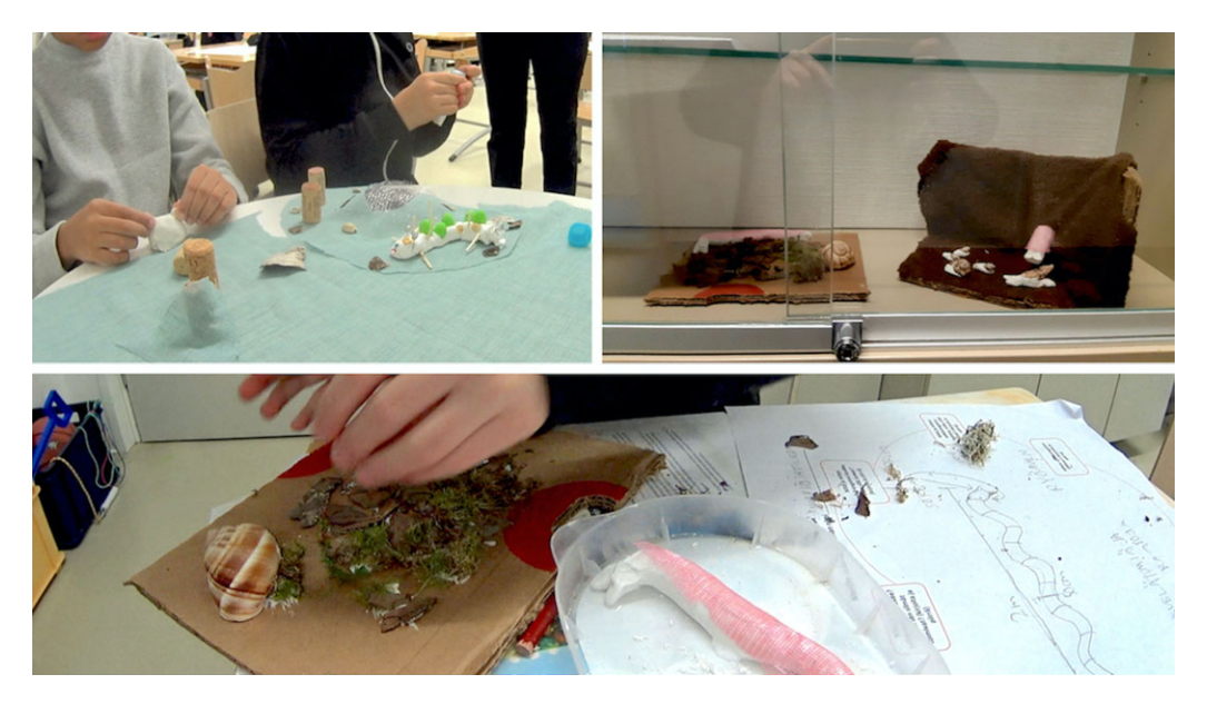
Figure 5. (Below) Kalevi creating a "dream landscape" for an earthworm and a snail; (Right) Kalevi's created props for his stop-motion film from the school art exhibition; (Left) Liam and Oliver constructing the landscape and characters for the story about purpra, the hybrid earthworm.