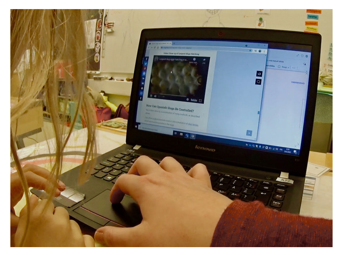
Figure 1. Delving into how Spanish slugs hatch.

picture of the encountered snail, picturing it with its shell. After this long silence, Kalevi erases the shell from the drawing and tells the researcher that he knows about an invasive species called the Spanish slug.