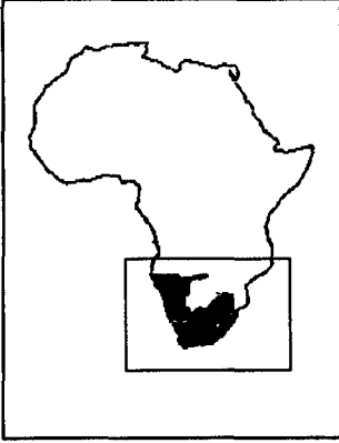
Map of South Africa and Namibia

E.90.L10 (Softcover) $14.00 (Hardcover) $20.00