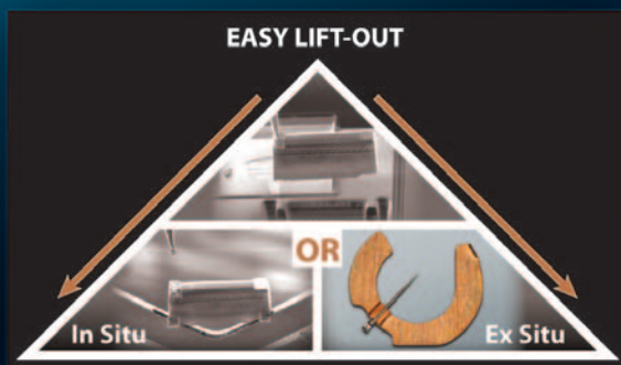
Grid Attach or Short-Cut™