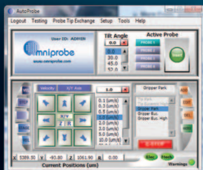
Easy In Situ Lift-Out with Closed Loop Feedback and AutoProbe™ Software