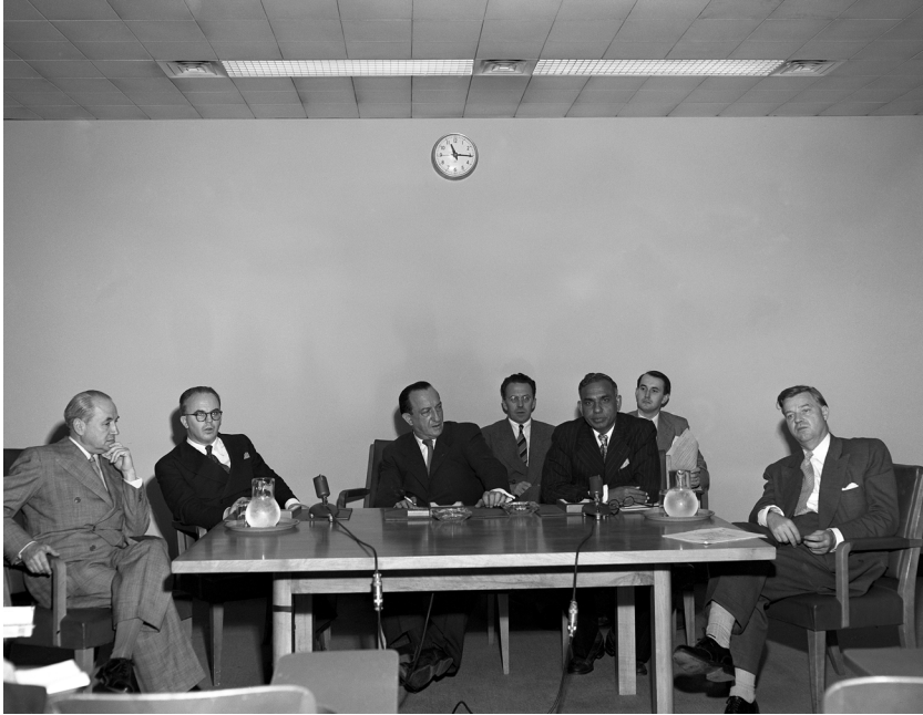
FIGURE 1.3 “Executive Secretaries of ECLA, ECAFE, and ECE Give Press Conference at UN Headquarters,” June 4, 1952. Raúl Prebisch is on the far left and Gunnar Myrdal is on the far right.