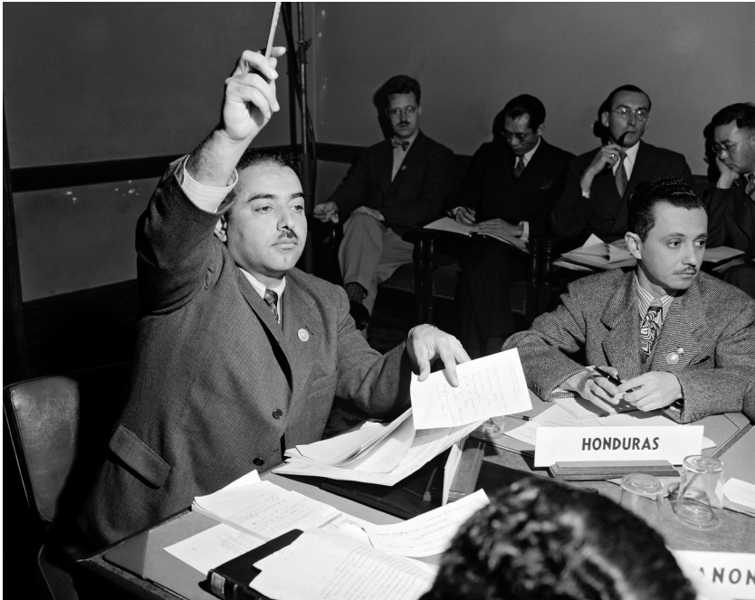
FIGURE 1.1 Djalal Abdoh, then a deputy of the Majlis, at the San Francisco Conference, at which the United Nations was founded, April 25, 1945.

divide on a material basis by which unfair mechanisms enriched one half of the globe and impoverished the other. The dominant forces that concerned him were not directly associated with the Cold War struggle for global primacy. Neither was the question of sovereignty viewed as a capitalist-socialist disagreement over the sanctity or vulgarity of private property. Instead, he insisted that the prolongation of imperial economic thralldom stood against the new era of decolonization. 7