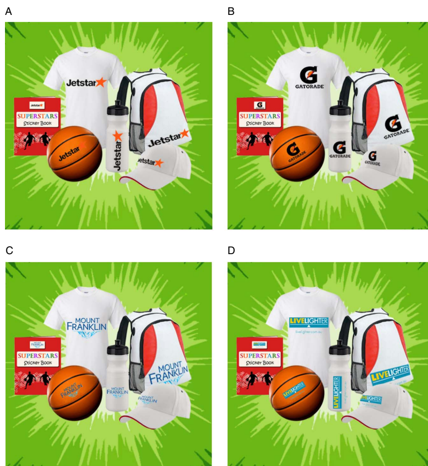
Fig. 1 (colour online) Examples of branded merchandise included in the sports packs by sponsorship condition: A, non-food branding; B, unhealthy food branding; C, healthier food branding; D, obesity prevention campaign branding

promotions (44–46) and consumer responses to sponsorship (47) in order to assess the following outcomes.