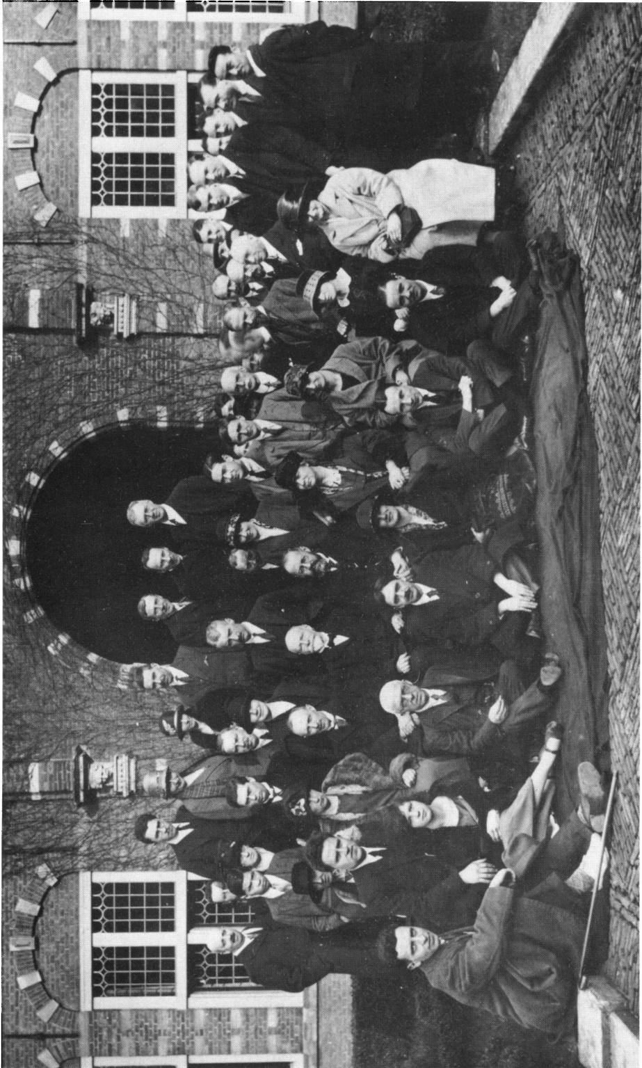
Plate 1: Physiological Society at the Franz Hals Museum, Haarlem during its first meeting abroad, 5 April 1925 (CMAC: SA/PHY/Z.4/1/151).