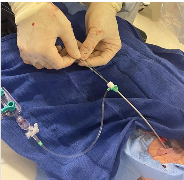
Figure 3. Image shows the 3 balloons are controlled with one hand, and the three wires are controlled with the other hand. Notice the side arm of the sheath is connected to a slow heparinised saline flush to prevent bleeding from the valve.

report, the triple kissing balloon technique was successfully employed a few times in two patients without any complications associated with the procedure.