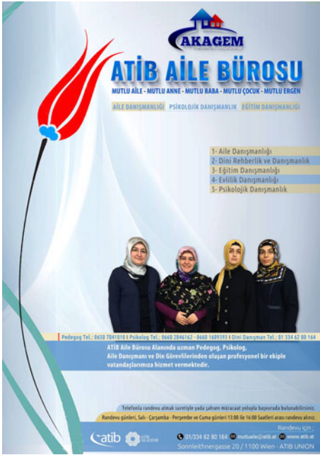
Figure 1. Poster of the Family Bureau, Austrian Diyanet foundation (ATIB).

This discourse, as we will see in the next section, also strongly mobilizes a feeling of national belonging expressed by a hyper-essentialist term such as ‘Turkishness’, a process that Ragazzi defines as ‘nationalization’ of the diaspora (Ragazzi 2009: 389–390).