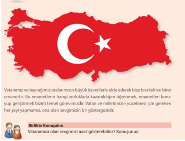
Figure 2. Picture of Turkey's Flag. Ahlâkım [My morality], p. 112.

This obedience is also expressed as love for the nation. The chapter addressing 'Love in the Islamic Morality' includes a section on 'Love for the Motherland and the Flag'. A picture of the map of Turkey (Figure 2) is colored by the Turkish flag, and a paragraph states: