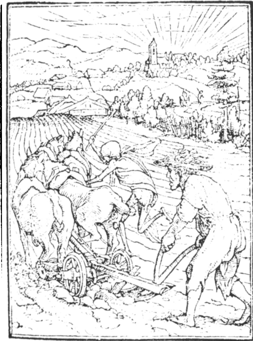
Holbein, The Ploughman From the Dance of Death, 1522-25