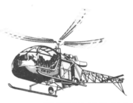
SUD-AVIATION 'ALOUTTE' II

All British shaft-driven helicopters in current production, as well as rotating wing aircraft now in production on the Continent incorporate ENV precision spiral bevel gears, ENV gears are also regularly furnished for aero engines,