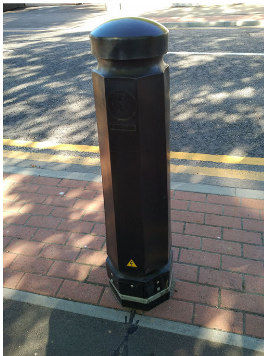
Figure 1. Sensor enabled pedestrian and cycle tracker.

As previously mentioned, there are significant challenges to considering the future implications of such novel systems and solutions that involve a wide range of stakeholders and contexts. We suggest that