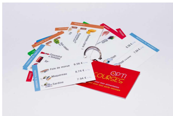
Fig. 2 Good Price Booklet distributed during Opticourses workshops

||| Yoghurts, fromage blanc, petits suisses.