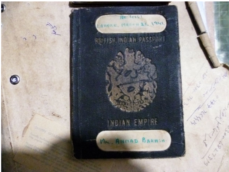
Figure 7. Indian empire.

from taking his property?” It is not a rhetorical question, but Chachnama records no rhetorical answer. To the Muslim commander, this idol was a strangely powerless God. Yet, I have always fixated on that initial startled reaction of the commander. The idol spoke before Muhammad bin Qasim did.