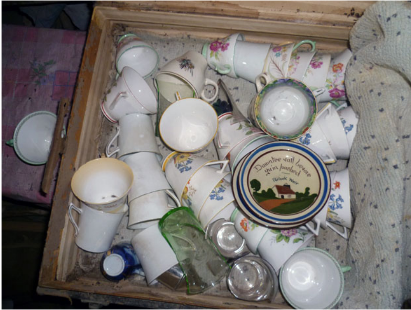
Figure 5. Cutlery.

in this archive, the stories that I wanted to excavate. 6 Here was a history of policing, a repository of all the sins in a small corner of the world. Every family's internal was external here. Someone like me, someone obsessed with stories, how long could I live in this room, by myself, I wondered.