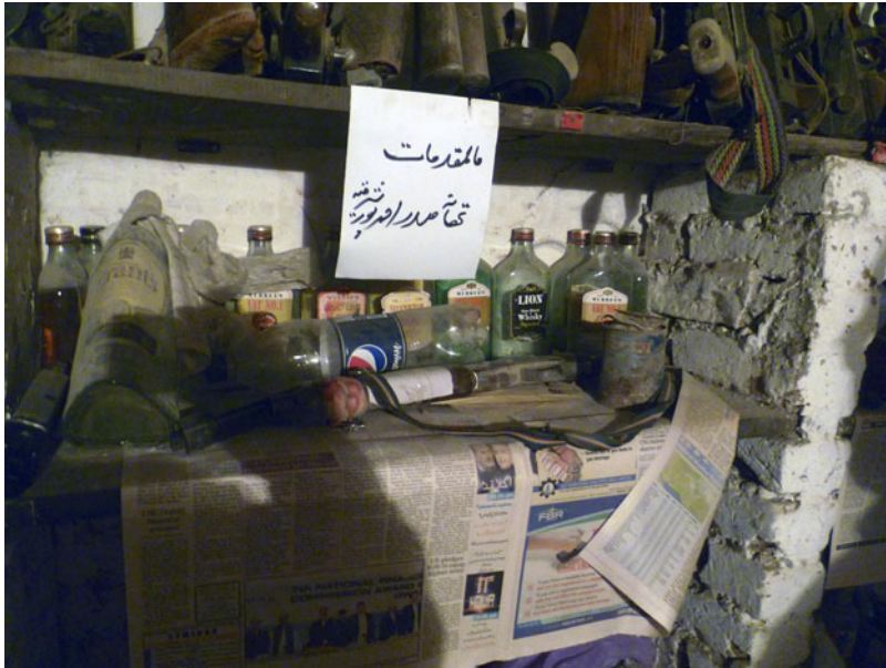
Figure 4. Bottled spirits.

They told me not to touch anything since it would be “dangerous.”