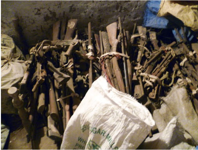
Figure 1. Bags of evidence.