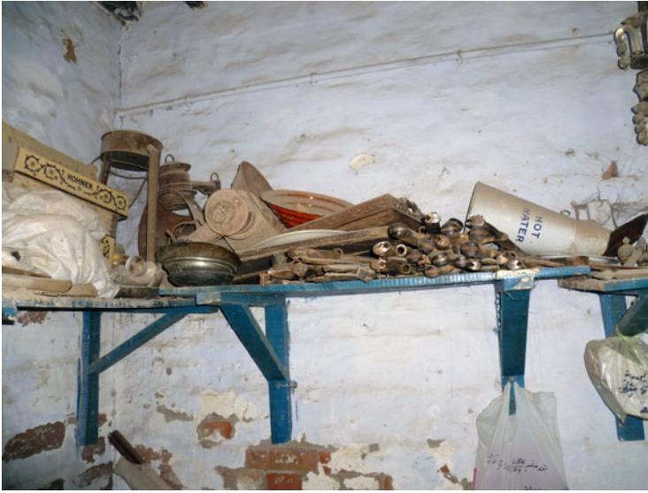
Figure 3. Murder weapons.