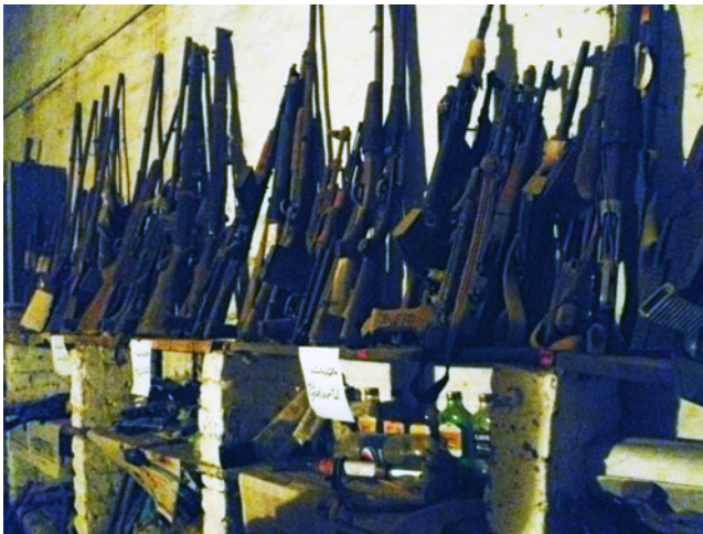
Figure 2. Murder weapons.