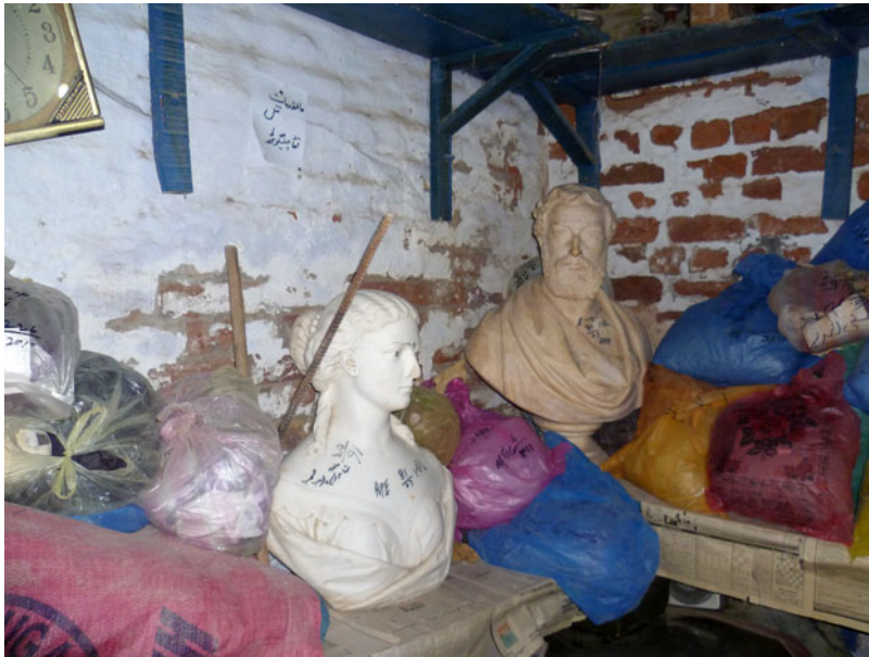
Figure 6. Idols.

from taking his property?” It is not a rhetorical question, but Chachnama records no rhetorical answer. To the Muslim commander, this idol was a strangely powerless God. Yet, I have always fixated on that initial startled reaction of the commander. The idol spoke before Muhammad bin Qasim did.