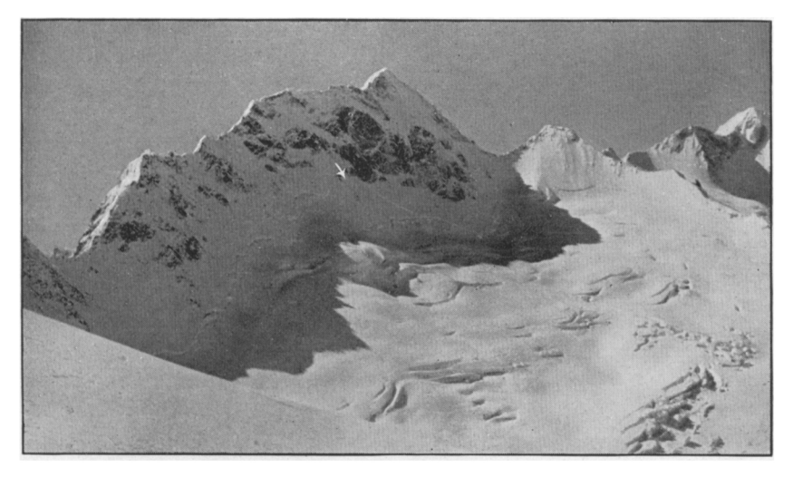
Fig. 5. Turnerkamp, Zillertal with Hornkees. The arrow shows where wind slab had collected at the foot of a cliff. Wind had blown towards cliff